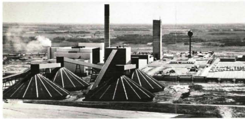
Canada's potash industry in southern Saskatchewan continues to grow rapidly. Annual capacity of the four mines operating in 1967 was 4,900,000 tons and, with the completion of six additional mines now under construction, Canada will become, in the early 1970s, the world's largest producer of this mineral.